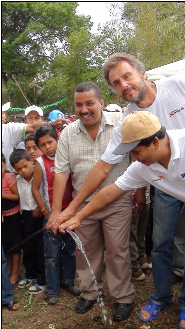
INAUGURATION OF WATER LINE IN GUATEMALA